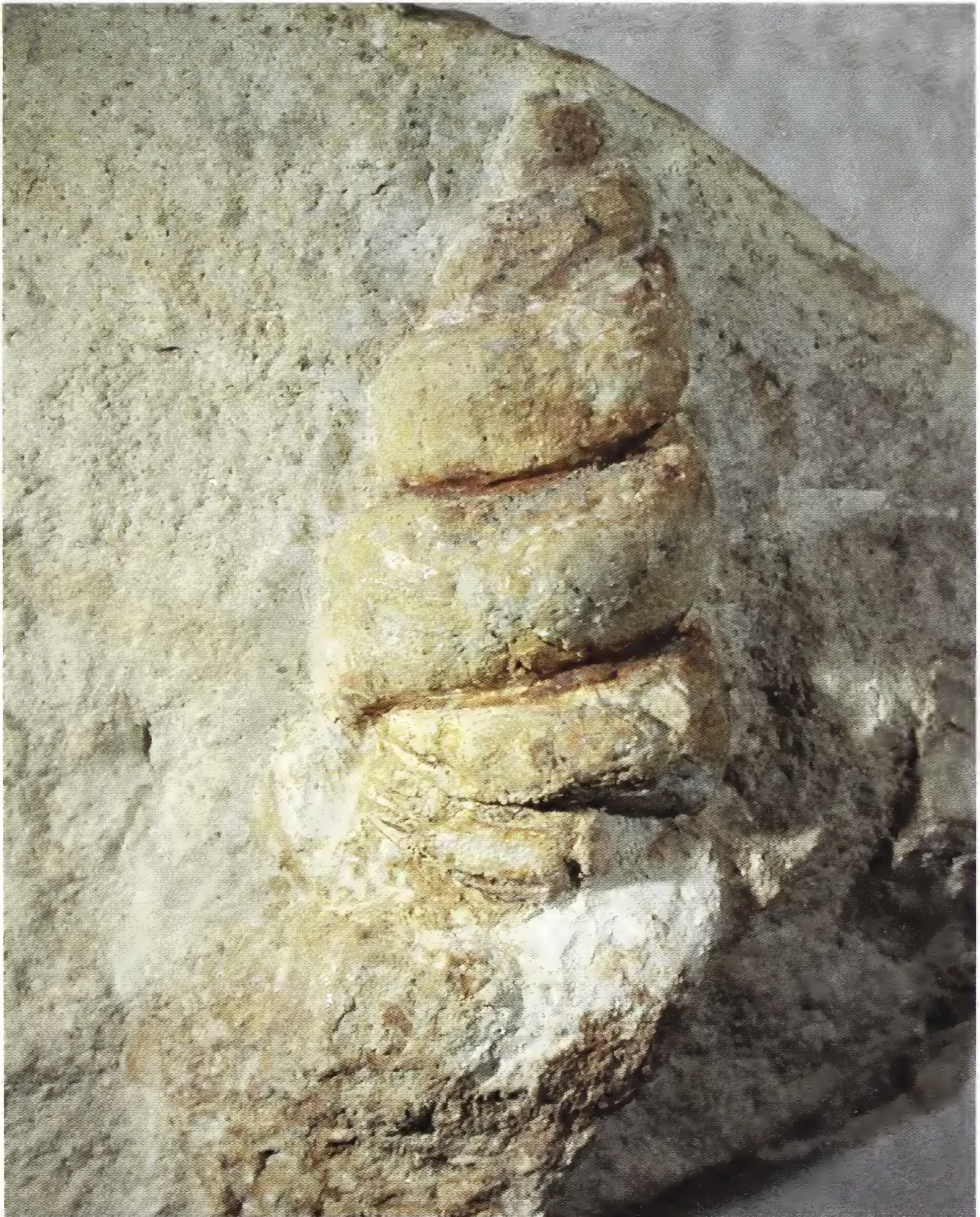
Fig. 2 – Paguristes baldoensis n. sp., MSNM i27220, holotype / olotipo (x 2).

Type locality: Ferrara di Monte Baldo (Verona).